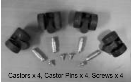
Castors x 4, Castor Pins x 4, Screws x 4

Items you should receive with your 'Castor Base' & Instruction Leaflet.