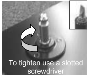
To tighten use a slotted screwdriver

The castor base will add approximately 20mm to the height of the cabinet.