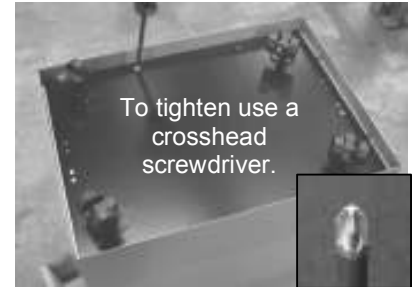
To tighten use a crosshead screwdriver.

Tighten screws using a crosshead screwdriver.