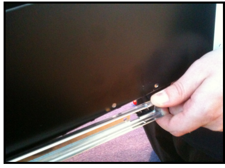
Position the metal tabs on each runner in line with the cut outs in the drawer