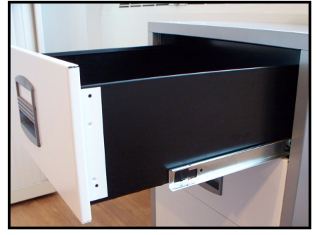
To remove drawers from a Home Filer first open fully the drawer you wish to remove.