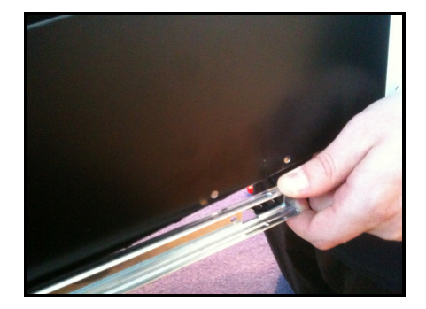
...once the tab reaches the side of the drawer lift the front of the drawer upwards and runner should come away. Repeat this on both sides