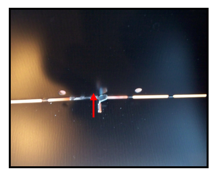
To remove the drawer lever the runner away from the drawer body which we will make the small tab slide outwards...