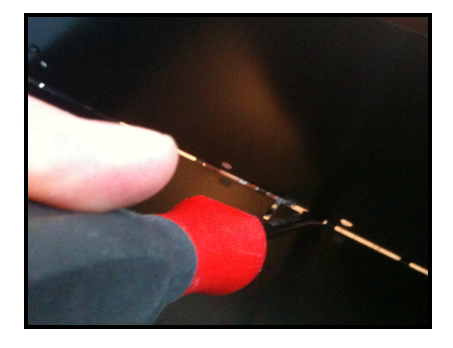
Slot the metal tabs on the runners back into the cut outs. You may need to use a flat head screwdriver to help lever back in.